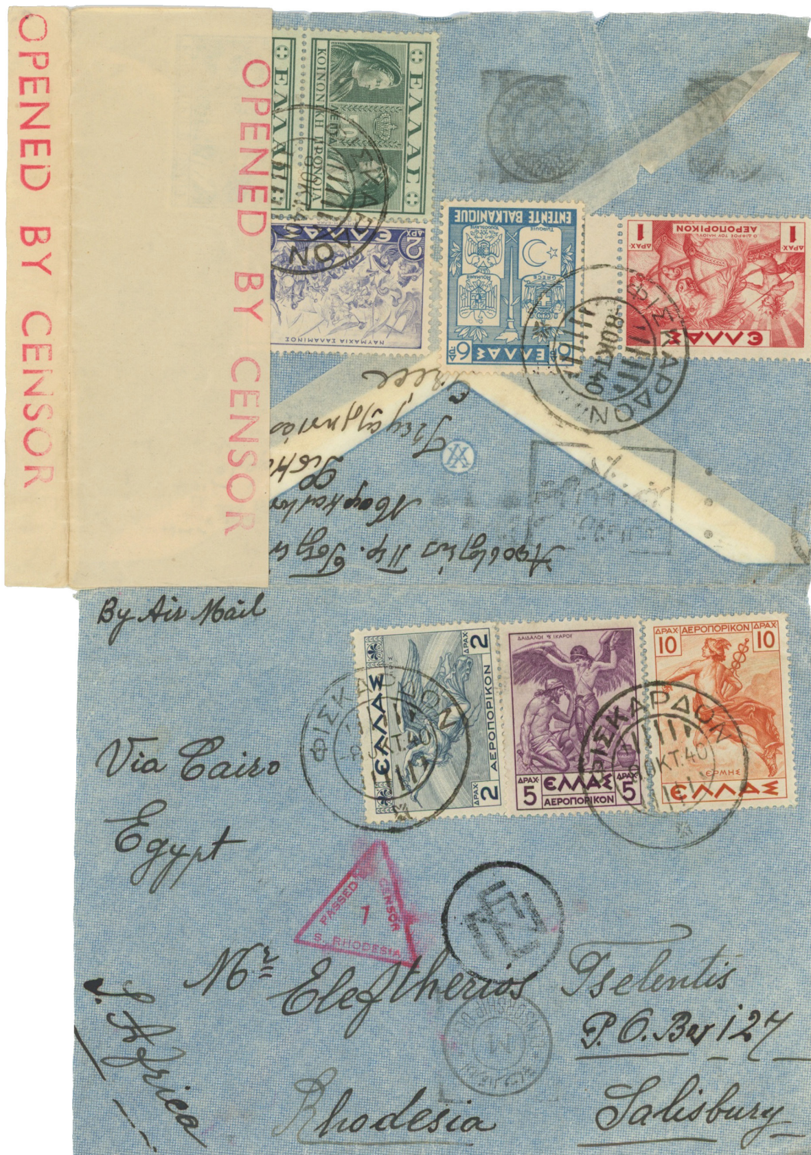
6δρχ Entente Balkanique + 2δρχ Historical issue & 2x50λ Charity (Queens), together with 1δρχ+2δρχ+5δρχ+10δρχ airmails (Mythological) tied on airmail cover with ΦΙΣΚΑΡΔΙΟΝ 8.ΟΚΤ.40 (Fiscardo, Cefalonia) sent to Salisbury, Rhodesia. Examined by the Hellenic Exchange Control, with small circular ΠΕΝ marking. Censored in Egypt, with black marking CENSORSHIP DEPT. and upon arrival in Rhodesia, with red triangular PASSED BY CENSOR S. RHODESIA 1 and linear handstamp OPENED BY CENSOR on blank censor tape. First weight rate to abroad (8δρχ) + airmail (18δρχ).