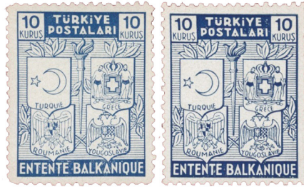
Two shades of the 10 krş value