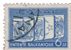
White dash on Σ of ΕΛΛΑΣ