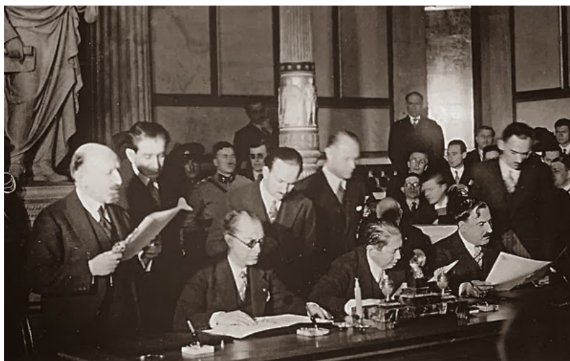
Balkan Pact of 1934

Ultimately, all the efforts of the Conferences were partially utilized by only four Balkan states with the signing of a Balkan Pact on February 8, 1934 in Athens. The Balkan Pact mainly concerned the effort of the states that favored the maintenance of the existing territorial arrangement (Greece, Turkey, Romania, Yugoslavia), excluding Bulgaria, but also Albania, which had clearly joined Italy's sphere of influence.