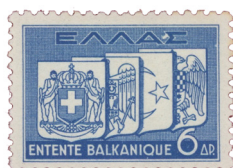
White patch behind Σ of ΕΛΛΑΣ