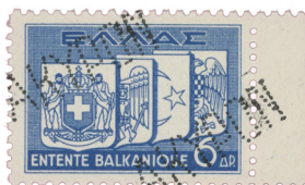
Forged dotted overprint AKYPON (=not valid)