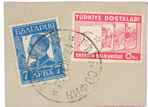
The 8 Krş Turkish stamp in combination with a 7 Лева Bul- garian, tied on fragment with ΓΑΡΑ ΣΟΦΙΑ - SOFIA GARE 17.XII.37