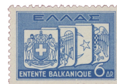
Break in base line